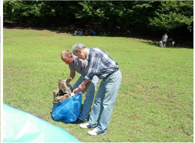
Photo. Improvement of the observation deck.

The exhibition of a biological diversity of agriculture has been arranged for participants after completion of the improvement works. More than twenty kinds of fruits, vegetables and the berries which have been grown up in this area have been presented at the showcase. The subject information on interrelation of a natural and agricultural biodiversity has been presented to the participants.