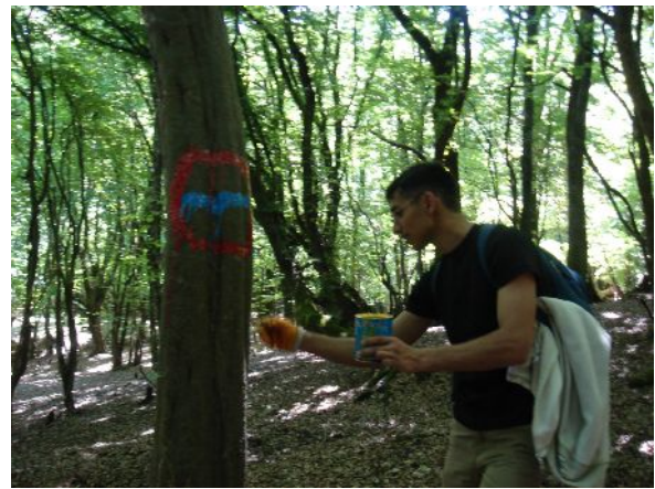
Photo. Drawing of signs of rare types of vegetation.