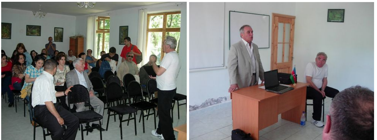
Photo. The round table participants.