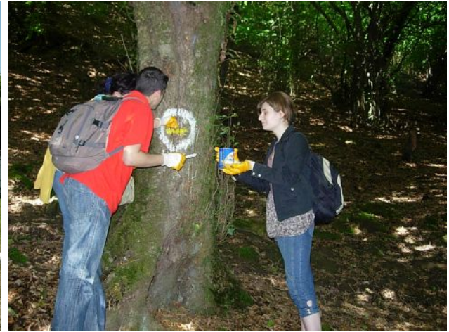
Photo. Works on drawing the direction signs of a tourist path.