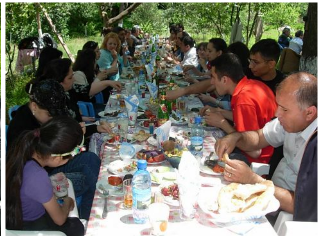
Photo. During discussion.

During wide discussions the participants of a round table accepted the appeal to the state and international structures with recommendations on increase of the cooperation efficiency in issues of preservation of a biodiversity and the environment.