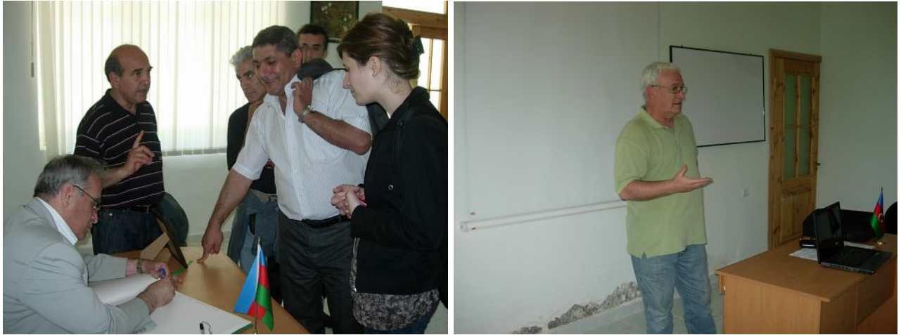
Photo. During discussion.

Speakers have noted that establishment of the national parks is significant step in propagation and informing of the public.