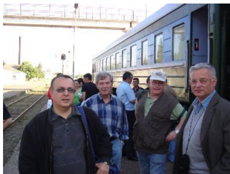
Photo. Departure to Lankaran by train.

Delegates’ departure was appointed at 23.30 on 31 st May and return at 7.30 on 2 nd June, 2008 (see the Picnic program).