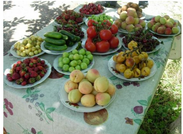
Photo. Biodiversity on an example of the various kinds of fruits, vegetables and berries grown up in Azerbaijan.